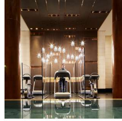
RECREATION OPERATION HOURS 7AM - 6PM