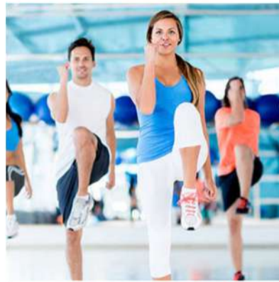
HI TABATA CLASS 10AM - 11AM