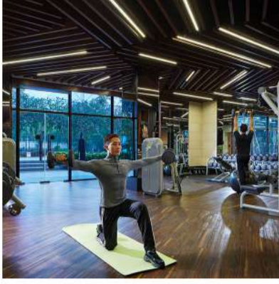
GYM OPERATION HOURS 7AM - 8PM