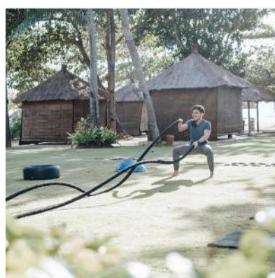
BOOTCAMP 10AM - 11AM