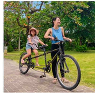
BICYCLE 7AM - 6PM