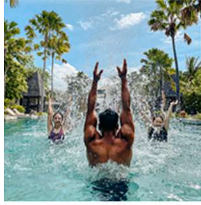
FUN AQUAROBIC 11AM - 12PM