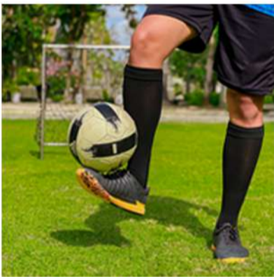
MINI SOCCER 7AM - 6PM