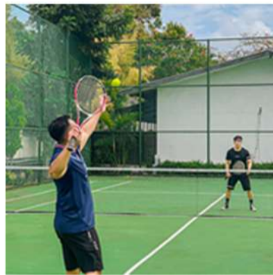
TENNIS 7AM - 6PM