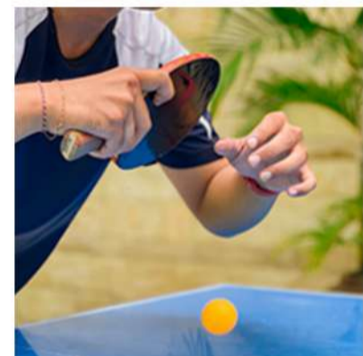
PING PONG 7AM - 6PM