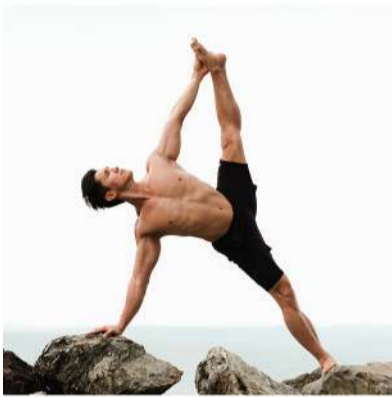
YOGA CLASS 8AM