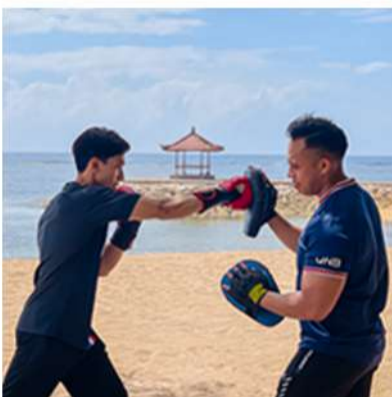
FUN BOXING 1PM - 2PM