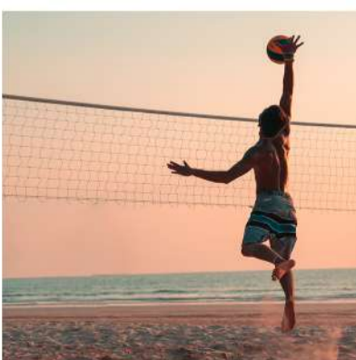
VOLLEY BALL 7AM - 6PM