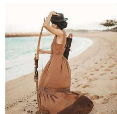
ARCHERY 7AM - 6PM